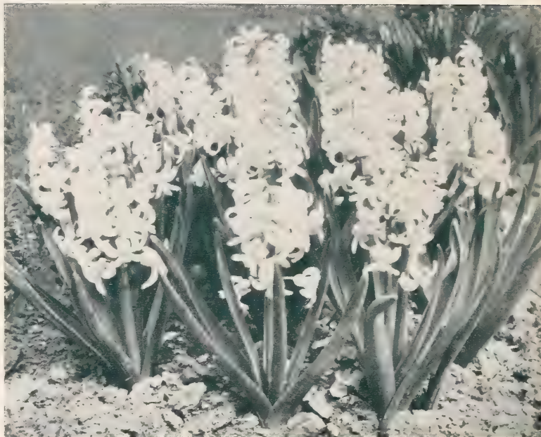
Beautiful Bed of Beckert's First-Size Hyacinths

First-Size Hyacinth Bulbs—any of the above—35 cts. each, $3.50 per doz., $24.00 per 100 (postage extra)